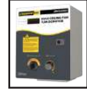
High frequency carrier technology to make the fan start smoothly and run noiselessly