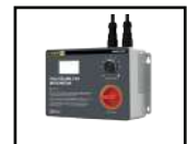
High frequency carrier technology to make the fan start smoothly and run noiselessly